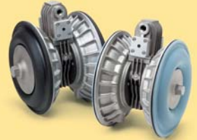
E3 3" Pumps

Elima-Matic technology is available in upgrade kits for Wilden® 1-1/2", 2" and 3" clamp band pumps. Air sections are available in aluminum, stainless steel or PTFE-coated. (Air chambers, air valve and center block can be nickel-plated for diverse applications.)